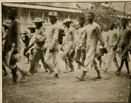
Insurgent prisoners, captured by the Twentieth Kansas, on their way to prison. [From a snap-shot.]

Up to the morning of June 16 all was quiet on the outpost, although a portion of the regiment was sent out on various